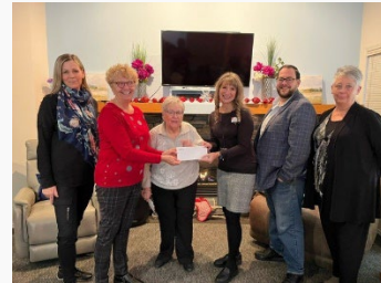
Osoyoos Credit Union Community Giving Donation of $3,000 in December 2023 will help with our volunteer training.