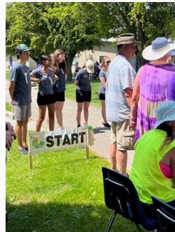
Oliver Ambassadors assisted with set up and clean up at the 2023 Hike for Hospice. Their participation was greatly appreciated.